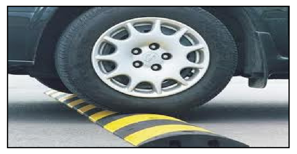
Figure 2. Industrial bump