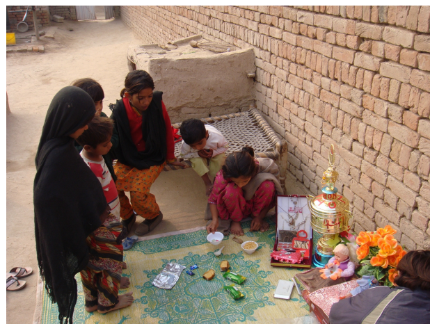
Figure 7. Girls arranging doll's marriage

Boys wander in the street, play hide and seek, or with a ball and a stick. Young boys, mostly above 15 years, sit in the street till late at nights playing board games and gossiping. They talk about their work, daily routine, and almost everything happening in the village and its surroundings. They have to do a lot of work especially in sowing and harvesting season but they find some time to play or get engaged