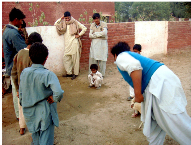
Figure 6. Boys playing in the street

Girls don't have too many choices to play due to lack of resources and restrictions to play outdoors. Therefore they are limited to few indoor games. Young girls mostly like to play with dolls. They have handmade or plastic dolls and best activity is to arrange a doll's marriage. Little girls gather in some friend's house and arrange a marriage. If they don't have a male and female doll, then they manage to identify the dolls by clothing them in gender. Such games are a source of social and traditional learning at home as well. They try to cook food, do some embroidery, sew clothes and almost celebrate in the same way as it is celebrated in reality. But, unlike boys, girls come out of the 'playing with dolls age' earlier. They have to learn the much needed real life skills. So they start learning sewing, embroidery, cooking etc in their leisure time.